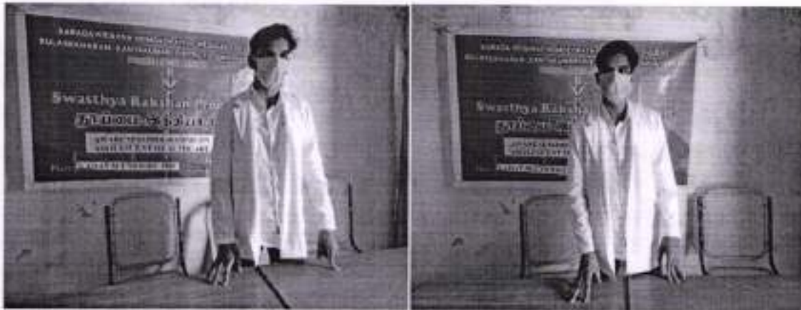
Awareness programme on Adolescent Health care at Kadayalumoodu PHC on 14.03.2022