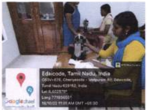
Training session - Woman’s livelihood enhancement programme- Employability training in Tailoring conducted on 19/10/22