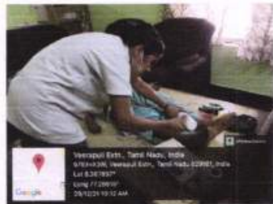
ECG assessment carried out for participants