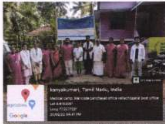
Medical team along with IFSD Volunteers