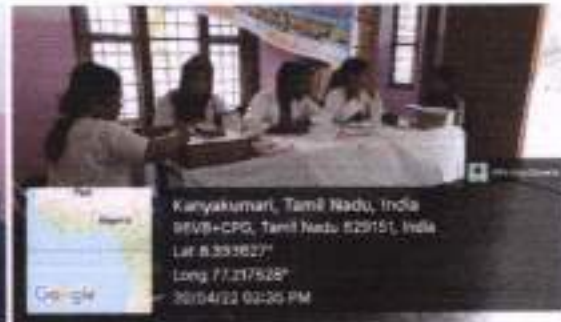
Screening by Medical team