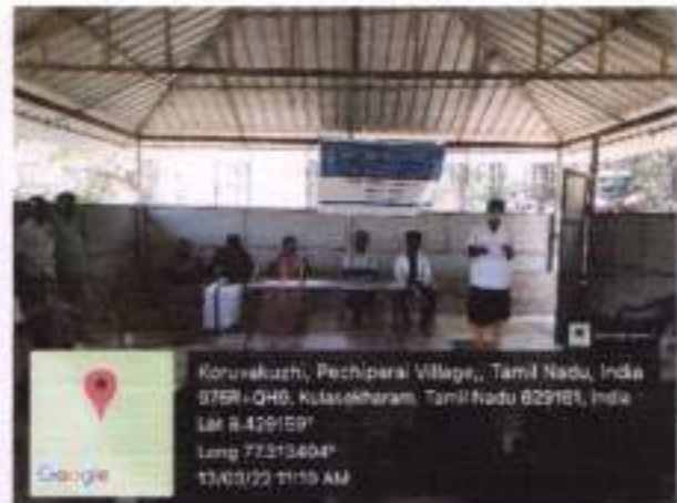
Special Camp Inauguration