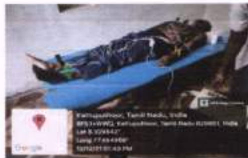
(a) Blood Glucose Assessment (b) ECG assessment on Cardiology awareness, Screening and Medical camp conducted on 12/12/21 at Kattuputhur, Azhagiapandipuram.