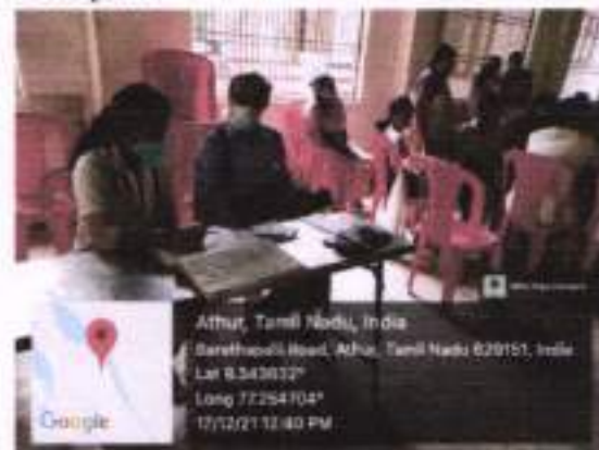
(a) Medical Consultation