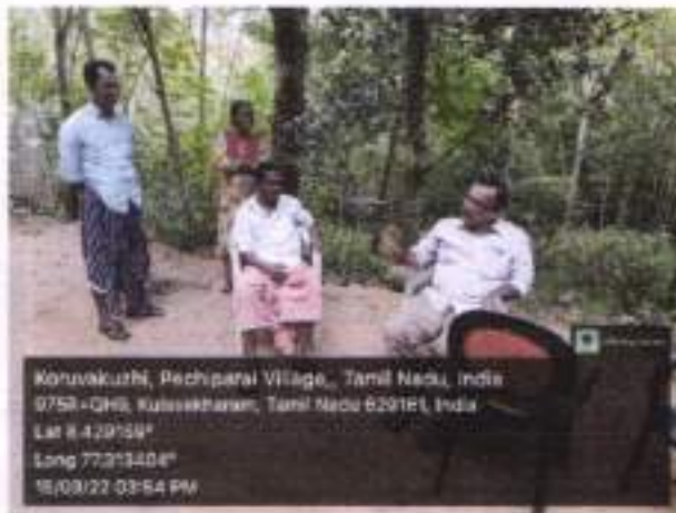
Interaction with Tribal people